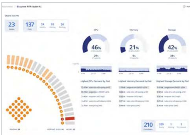
Kubernetes dashboard showing clusters and utilization

Active IQ's predictive analytics directly visible from Cloud Insights. Directly identify Active IQ risks and take advantage of prescriptive guidance.