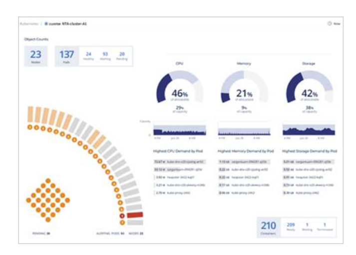
Kubernetes dashboard showing clusters and utilization

An extensive API allows integration into a wide variety of third party services and applications. From metadata integration with a CMDB to alerts to a wide variety of messaging and events management tools, and custom metrics from just about any application and service out there.